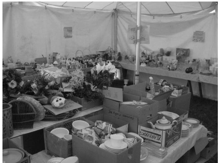
Contributions to the Annual Flea Market. What a treasure trove of trinkets and "junk!" The Historical Society is lucky to have contributors and buyers at this annual sale.

What's it like to get ready for the Flea Market every September? Lots of work by lots of people! We're grateful to families who bring their yard sale leftovers or items from a house they're emptying to our barn all year long. They are the items we sort and put out for sale every year to benefit the Historical Society. The last Saturday in September we fill rooms in the house, the connector, the barn and two tents that the Lions Club puts up for us. Thank you to everyone who helps. It would not happen without your contributions or your hard work.