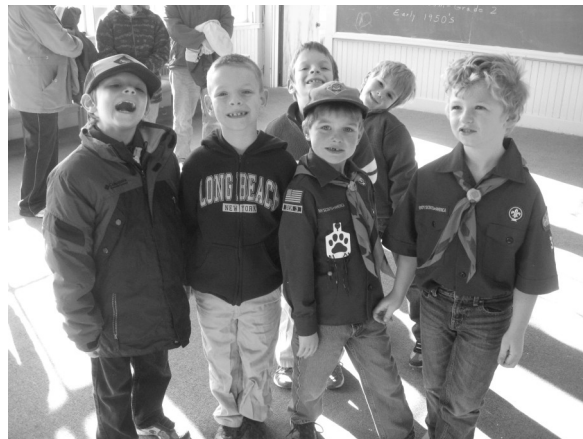
A den of curious Tiger Cub Scouts toured the Upton Building.

On a beautiful Saturday in November six Tiger Cub Scouts and their parents took a tour through the Upton School to fulfill a Scout requirement “to visit something old”. Now, to first graders, pretty much everything is old, but it was a lot of fun showing them what school was like one hundred years ago. They asked some terrific questions and were very interested in how the Historical Society plans to use the building after we’ve renovated the building. Peering into the old coal bin area was spooky, but they loved the big spacious rooms upstairs. A reminder: anyone who wishes a tour of the Upton School is welcome to call the Historical Society and someone will be happy to take you through. Individuals or groups are welcome!