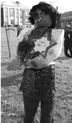
The "Best Group" winner of the scarecrow contest was this lovely bejeweled model!