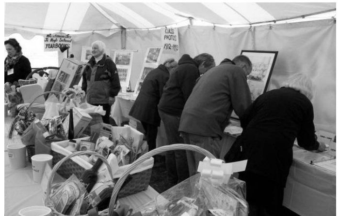
A big attraction at the 100th Birthday Party was looking at the albums of class photos from 1912 to 1993.

And, tours of the Upton School. The comments were treasures! Do you remember the lines to the basement (where the bathrooms were)? This room had my favorite teacher! And, oh yes, that's where the movie room was in the 1970s, and in the basement was where they had to put the 7 th grade when we ran out of room in the rest of the school before Oakmont was built! The memories came flooding back.