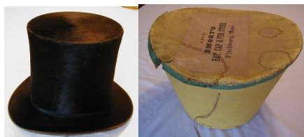
This top hat with its original box was given by Minott family descendants.