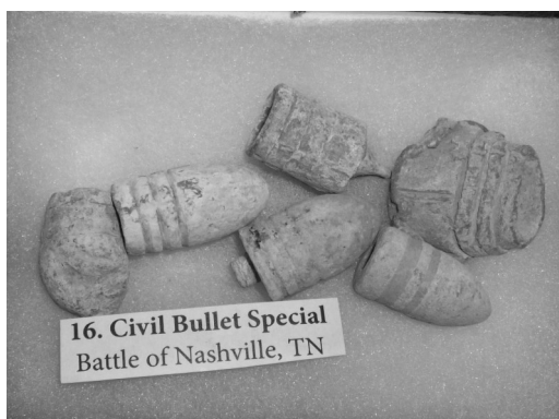
Civil War bullets found in Tennessee

Since it did not belong to anyone from Westminster, it will also go into our Education Department and can be used by anyone who has an interest in it.