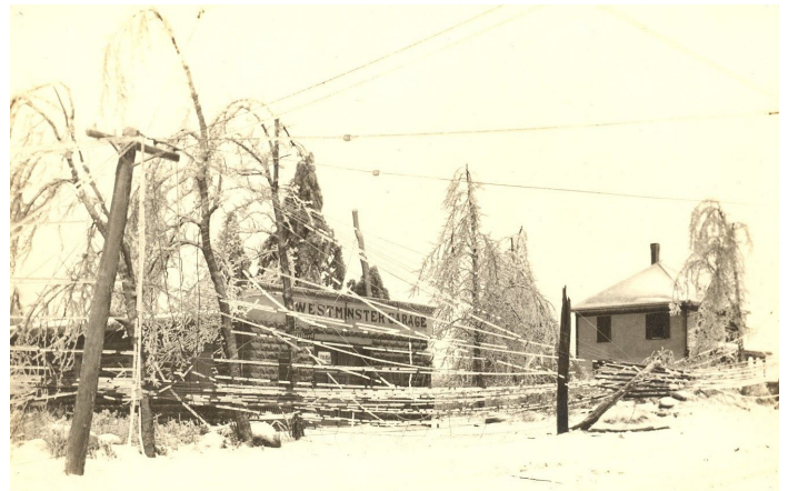
The Westminster Garage, then owned by Leonard Fairbanks.

All street car service was suspended early this morning. Falling trees and branches and limbs dropping off unexpectedly were a constant menace to pedestrians and wheel traffic. Hundreds of narrow escapes of people walking and in automobiles endangered by falling limbs from overhanging shade trees were reported during the day. Highways and sidewalks were littered with broken branches and fallen tree trunks. In many places the sidewalks and the roadways were completely blocked.... Telephone and electric light workers were called out early this morning, but the damage to over-head wires is so widespread that it will be several weeks before the electric or telephone service will be back to normal.