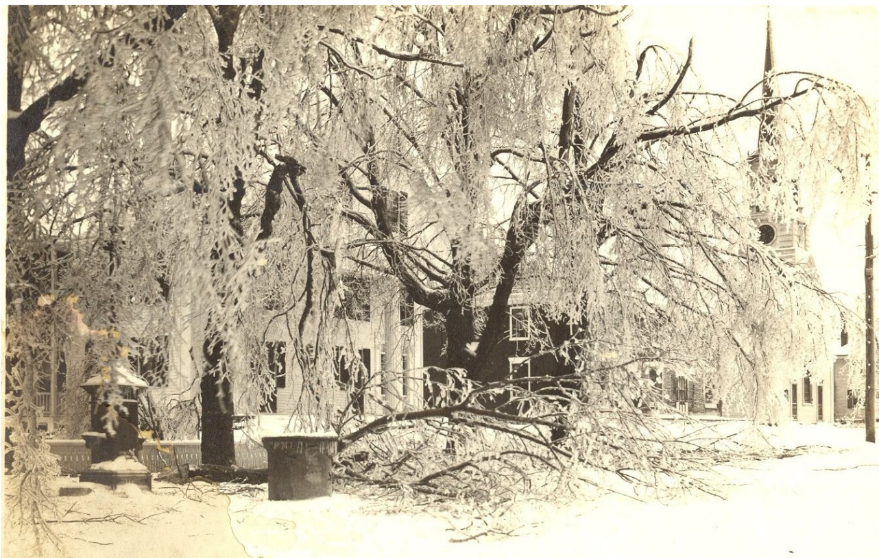
This photo is of the big ice storm on November 28, 1921. (See front page story.) It is one of the clearest photos of the horse watering trough that used to be between the Universalist Church (now the American Legion Hall) and the Clark's house (now the Masciarelli Funeral Home). There were several throughout town for everyone's horse to drink from. This one on Main Street has been missing for years. If you know its whereabouts, please let us know!