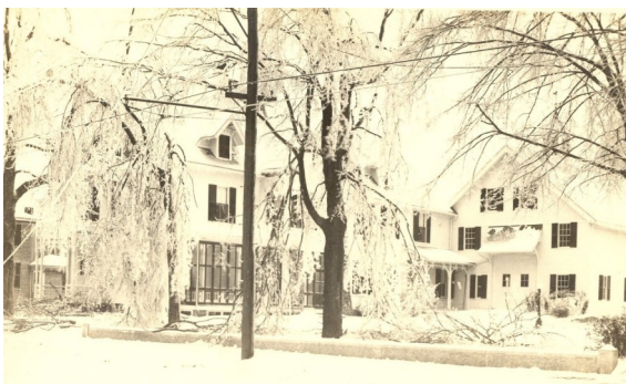
The Putney House on Main Street next to the Historical Society House.

The Gardner News of November 28, 1921 stated, “Thousands of dollars worth of damage was caused by the most devastating ice storm in years that swept through Gardner during the night. With the main feed wire supplying electricity to Gardner broken down along the high tension wire all industry dependent on electricity for motive power was paralyzed... Hundreds of telephones were put out of commission. In many sections of the town telephone and electric light poles snapped off and toppled into the highways. Fire alarms and police signal systems were crippled. Highways through the town were strewn with fallen trees and huge limbs that were broken off by the heavy ice coating that encased everything.