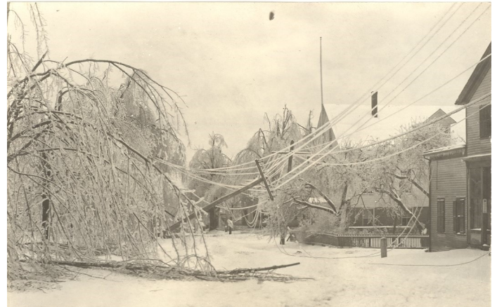
Bacon Street with the old Town Hall and the Lynde House (now the Pharmacy) on the right.

It was quite a storm, and surpassed only by the Ice Storm on December 2018. THAT one was one for the history books as well!