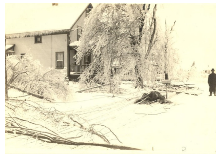
A house on the way to South Gardner, near the Power Plant for the trolley.

All street car service was suspended early this morning. Falling trees and branches and limbs dropping off unexpectedly were a constant menace to pedestrians and wheel traffic. Hundreds of narrow escapes of people walking and in automobiles endangered by falling limbs from overhanging shade trees were reported during the day. Highways and sidewalks were littered with broken branches and fallen tree trunks. In many places the sidewalks and the roadways were completely blocked.... Telephone and electric light workers were called out early this morning, but the damage to over-head wires is so widespread that it will be several weeks before the electric or telephone service will be back to normal.