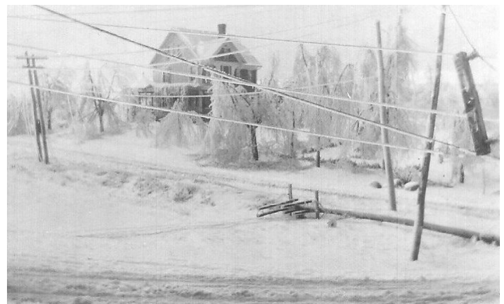
The old road to Gardner—now Route 2 West.