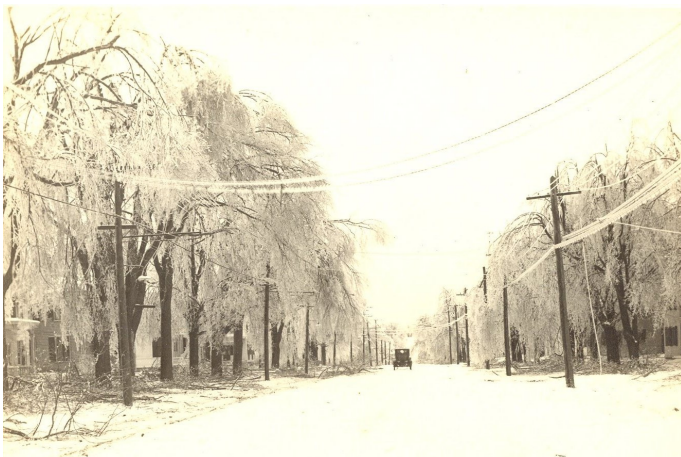
A lonely Model T on Main Street after the ice storm.